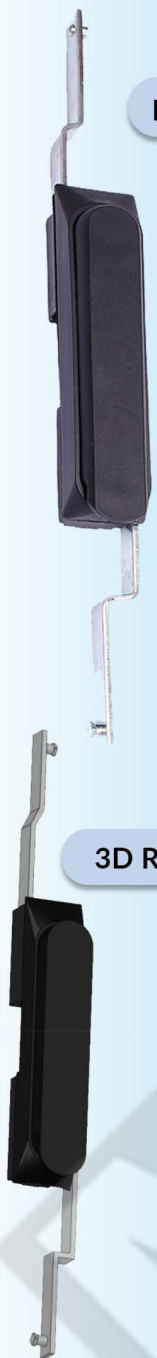
3D Rendered View